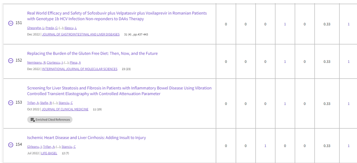
Citation Report Publications Table