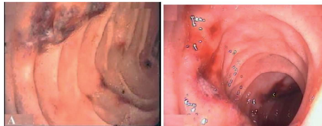
Figure 2. Endoscopic appearance of the second part of duodenum: multiple erosions, diffuse redness, submucosal hemorrhage, and small ulcerations.

In some selected cases, CT angiography can be used to visualize the site of the arterial or venous occlusion; however, a normal angiogram does not rule out the possibility of mesenteric ischemia [3]. Mesenteric vascular engorgement and skip areas are also seen in Crohn's disease, but terminal ileal involvement, stricture, fistula, and abscess would favor Crohn's disease over other conditions [12, 33].