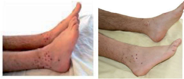
Figure 1. Palpable purpura on both ankles.

The typical rash is symmetrically distributed and located primarily in gravity-/pressure-dependent areas, such as the feet, ankles, and lower legs in adults; in the case of children, the buttocks, face, trunk, and upper extremities are more affected [19]. In child patients purpura gradually disappears (it can recur and become chronic), but in adults, it may be necrotic or hemorrhagic in 1/3 of cases, and cutaneous exacerbations may be seen for 6 months or longer [20, 21].