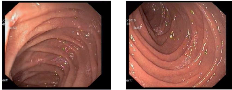
Figure 3. Endoscopic appearance of the second part of duodenum remission.